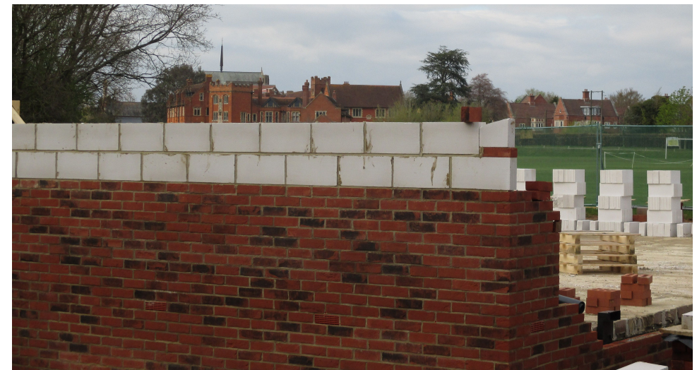
Progress on site 18 April 2016